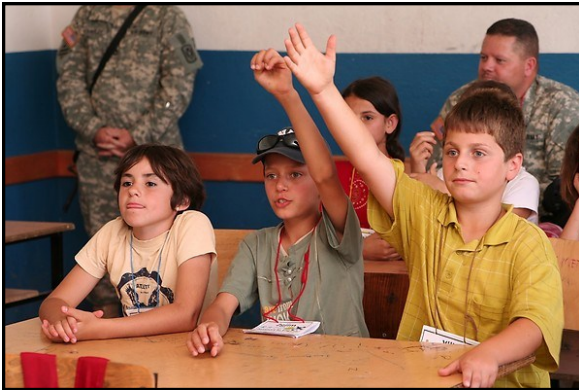
Kosovar children in English class