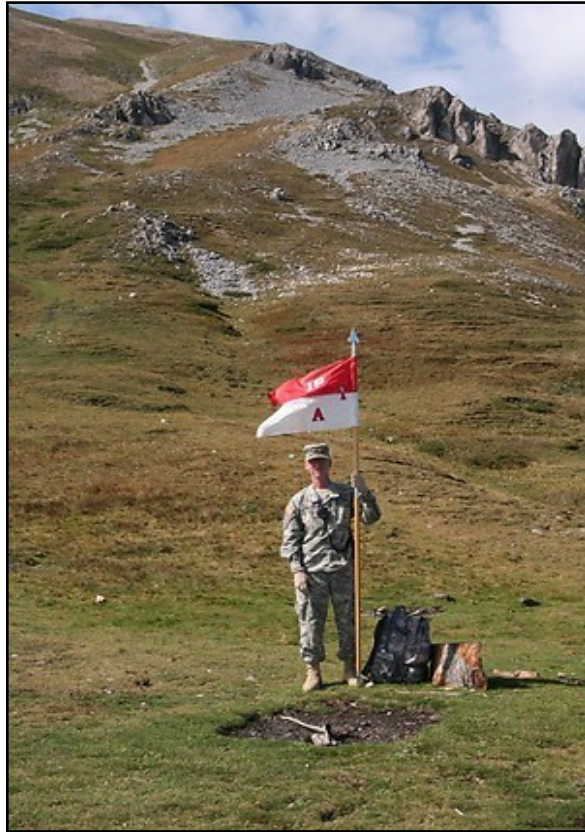
Alpha Troop soldier on Mt. Duke