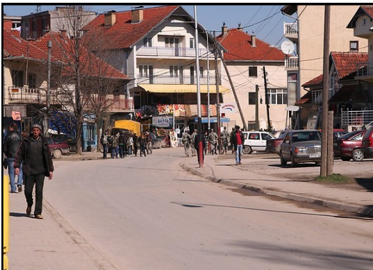
A Kosovo neighborhood

The cities, like Pristina the capital, were a mix of drab soviet-style apartments and administration buildings, sleek, modern offices and hotels, quaint old stone houses with red tile roofs, a scattering of ancient Roman and Byzantine edifices, and proud historic mosques and churches—some of them hundreds of years old.