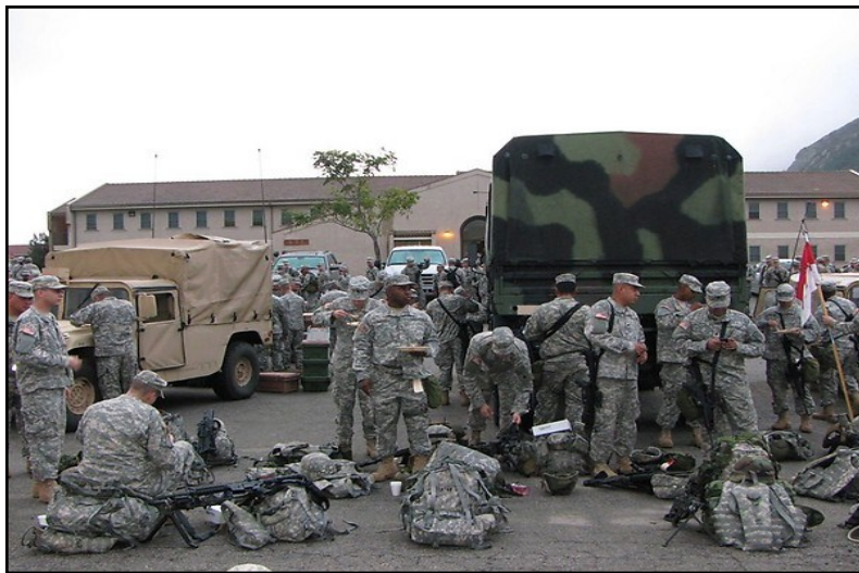
Welcome to Camp San Luis Obispo

At the armory, rosters and records were checked and updated, while weapons and equipment were inventoried, issued, assembled, and checked. Of particular interest was the new M68 Close Combat Optics (CCO) sight system for the M4 carbine. The troopers had to install it themselves and were eager to try it out on the ranges.