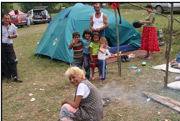
Camping out at the vigil site