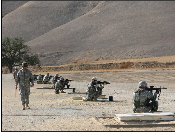
On the rifle range at Camp “Bob”

ley, there is a “Th-th-th-th-thump ...” followed by “CH-CH-CH-CH-CHAM!” invariably bringing a grin to the face of the first-time shooter.