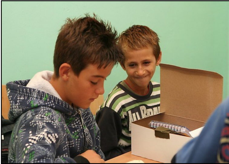
A Kosovar child “checking out” his box of school supplies