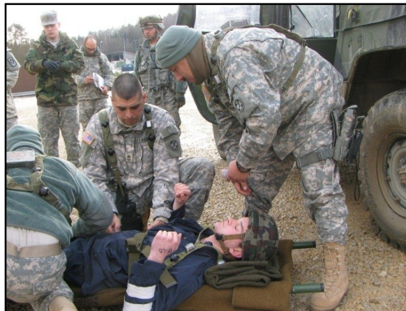
Very realistic training

Of course, role players and troops alike wore “laser tag” harnesses, and all weapons were safely loaded with blanks. All the while, experienced trainers observed the troopers, refereed and advised when needed, and took notes that would be used in later critiques.