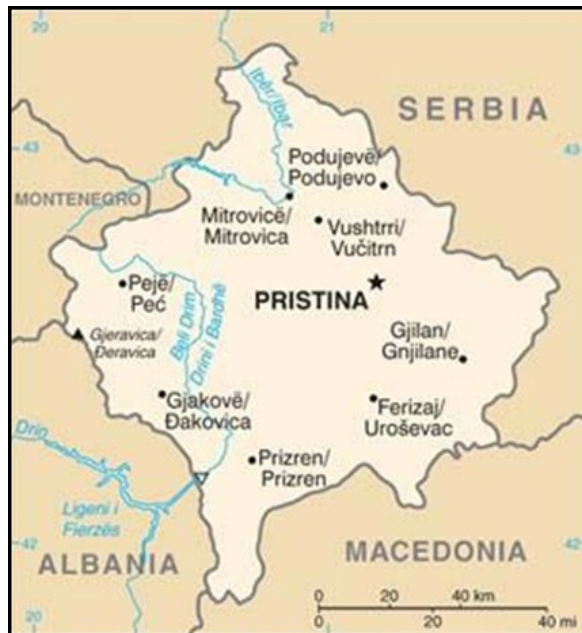
Map of Kosovo

The geography of Kosovo could be described as a large landlocked basin, averaging between 400 and 700 meters (1,300 and 2,300 feet) above sea level, surrounded by several high, rocky mountain ranges, that tower up to 2,565 meters (8,415 feet). It was the peaks of these surrounding mountains that defined the borders of neighboring Montenegro in the west, Albania in the southwest, Serbia in the north and east, and Macedonia in the southeast. Indeed, the southern mountain pass provided the gateway into the country from nearby Skopje, the capital of Macedonia, which lay only about fifteen