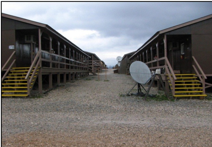
Barracks at Camp Bondsteel

Several modified SEA huts were used for Special Operations Command and Control Elements (SOCCE) and served as headquarter facilities. Generally, the 1-18 th Cavalry found the accommodations safe and comfortable, but they had to have adapters for their personal electronic equipment to work on the European 220 volt, 50 Hz electricity.