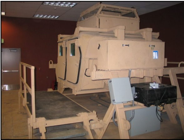
The Humvee Egress Assistance Trainer

It wasn't easy getting out; your head would still be spinning and you didn't know which way was up for several seconds. The machine gunner's position on top was the most at risk, as he could get thrown out or crushed in the rollover, so he had to learn how to duck down immediately to protect himself. Even in this relatively slow, gentle simulation,