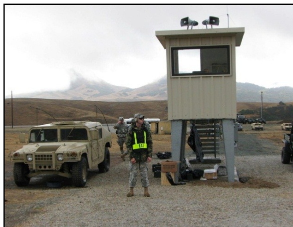
A range at Camp Roberts

At the same time, other troopers were trained on the 12 gauge