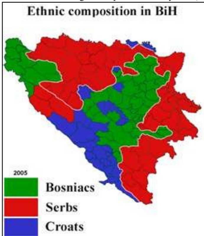
Ethnic composition of Kosovo in 2005

In 1991, Bosnia erupted into war, during which millions were displaced and thousands died. In 1992, Milosevic formed the Federal Republic of Yugoslavia, but it was not recognized by the West. By 1995, a fragile peace was realized