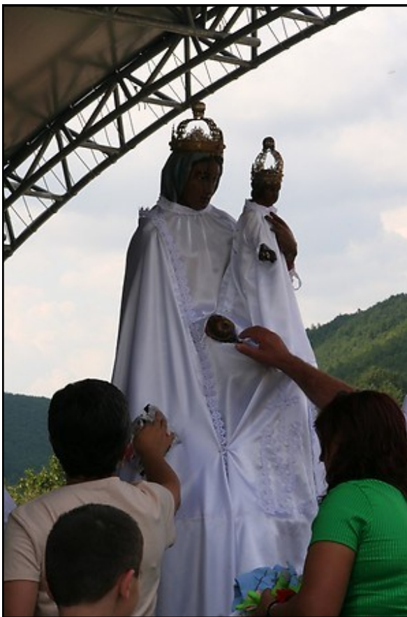
The Black Madonna

O n Ascension Day in August, 2009, the 1st Squadron, 18th Cavalry provided security for the festival of the Black Madonna in Prishtina. There are a number of “Black Madonnas” throughout the world, especially Europe. Generally, they are statues of the Virgin Mary, notable for the fact that she is depicted with dark or black skin, despite having obvious Caucasian features or origins. Often they were carved in Medieval times and either got their dark color from a sooty patina deposited over the ages by innumerable tallow candle flames, or they were carved from a dark hardwood in the first place, with the paint, if any, wearing off over time to reveal the tawny wood color underneath.