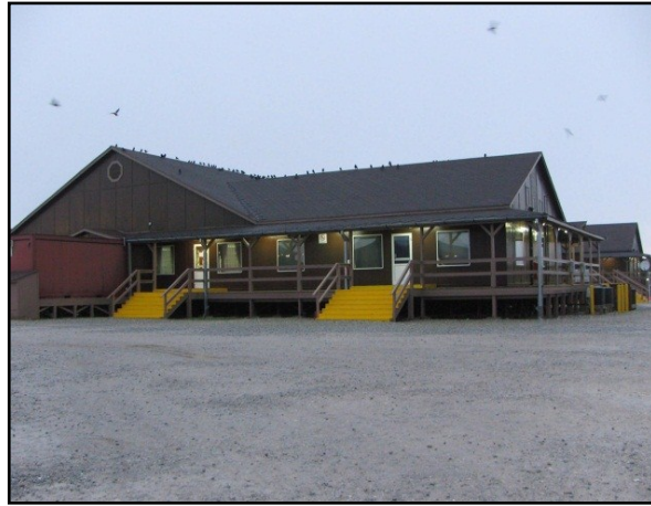
Camp Bondsteel Dining Facility

Since General Order Number One forbade the consumption of alcohol on base, only non-alcoholic drinks, such as soft drinks and "near-beer" could be obtained on the post. It was for this reason that the Greek contingent refused to stay at Camp Bondsteel, but set up a base of their own just down the road, with the requisite drinking establishments on their post!