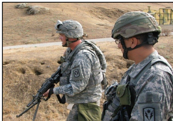
Home on the range