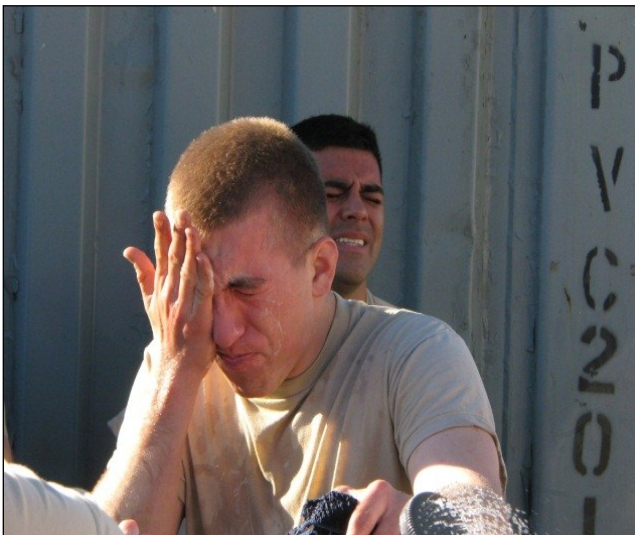
A little pepper spray makes for very realistic training

Another non-lethal weapon added to their arsenal was the taser, a small hand-held weapon that fires a couple of wires with barbs on the ends and delivers ten thousand volts of non-lethal electric current into the hapless victim. When the strongest man gets hit with a taser, he can only fall on the ground and writhe in pain for several minutes afterwards, totally incapacitated. Troopers were trained on how and when to use it, and hearty volunteers were hand-wired to experience its effects on them-