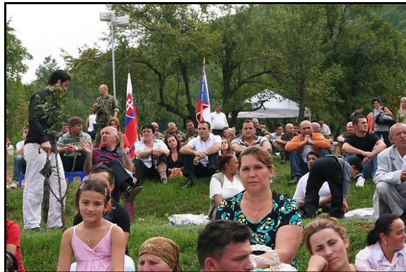
Kosovars at the vigil site