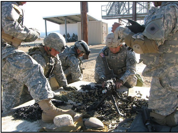
Clearing an M240B machine gun

combat shotgun, a version of the black “riot gun” used by police forces for close combat in the field or urban environments. The combat shotgun facilitates quick reaction shots that don’t allow for precise aiming. Its outstanding feature is that, in addition to the intimidation factor, it provides positive stopping power, without blasting through interior walls, possibly injuring innocent or friendly personnel in the next room.