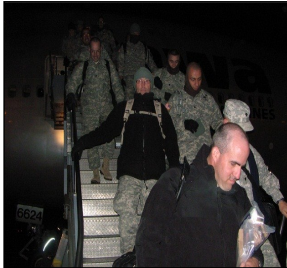
Arriving at Camp Atterbury

the next eight weeks, they would be trained for deployment overseas. Sometimes it would be grueling; sometimes it would be fun, but it was always intense and interesting.