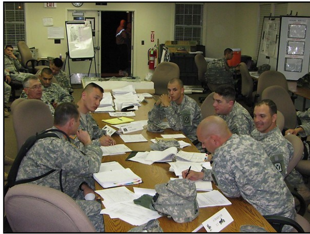
“Sabre 3” leads another daily training meeting with Unit Commanders

the command center, where the daily action was monitored and directed by staff personnel. At the end of the day, the Squadron's performance was critiqued and discussed at staff meetings.