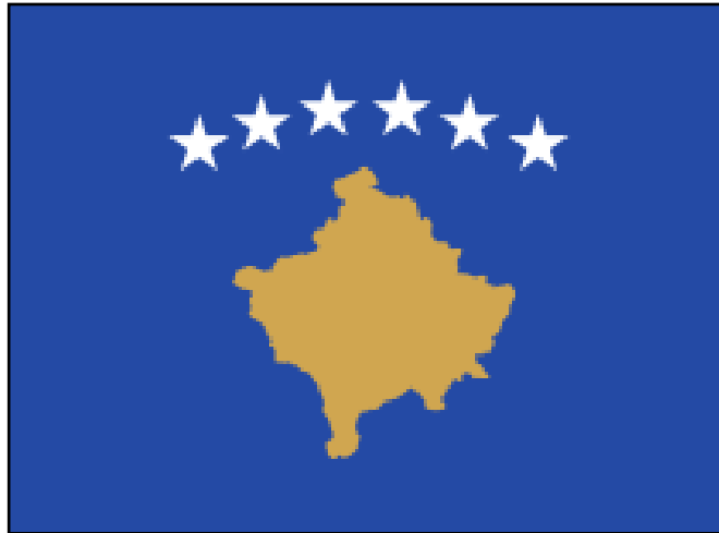
Flag of Kosovo

The predominant languages are Albanian, Serbian, Serbo-Croat, and a little English. Most of the people in our AO speak Albanian and all of our patrols bring an interpreter. Kosovars are kind and pleasant for the most part, grateful to all Americans and respectful of our martial capabilities. Although Kosovo declared their independence over a year ago, most still identify themselves by their ethnicity rather than their country. Hence, you see the Albanian flag on about every fifth house in our AO along with the Kosovo and U.S. flag on about every tenth house. This self-perception is important to note because it affects every aspect of a Kosovars life.” NOTE 1