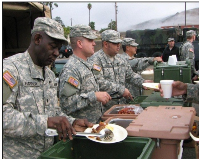
Hot chow at Camp SLO

As important as the exercise was for the troopers, it was also an exercise in communication and control for leaders in the field and at