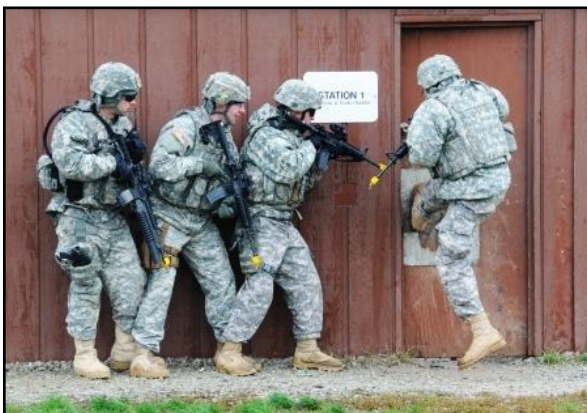
Urban warfare training at Camp Atterbury

The 1-18 th Cavalry wasn't going to war; this was literally going to be a "police action," so in addition to the traditional warrior skills intended to be used for "killing and breaking things," they had to be trained in the non-lethal weapons and tactics that are familiar to police forces the world over in preparation to manage what was euphemistically called "the worst day in Kosovo", similar to the events of March