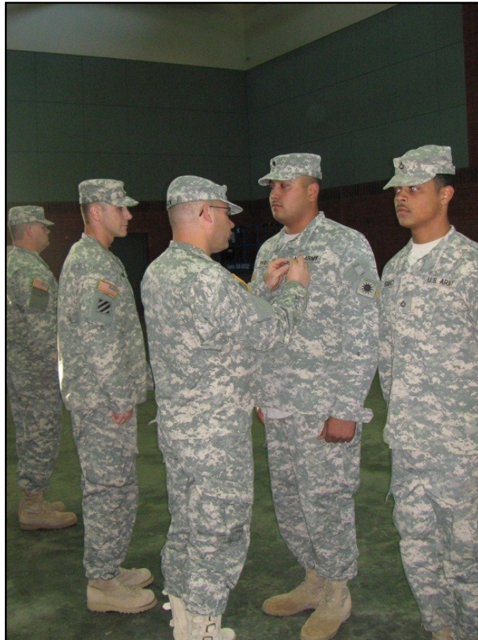
Awards and Decorations ceremony prior to departure