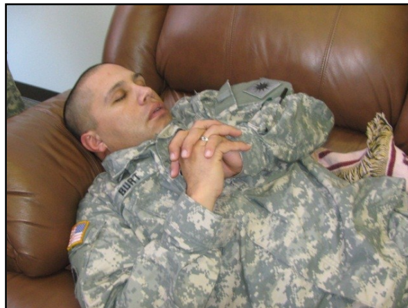
A few “Z’s” before leaving

By 0930 hours, the Squadron was on the tarmac at John Wayne Airport, waiting with all of their personal gear to board the jet. It was a beautiful, warm Southern California December day and in the best traditions of the Army, men lay on top of their bags in the shadow of the big jet, “trying to catch up on a few Z’s” while they waited. Since this was a charter flight, it took a while to load all of their bags and ready the plane, so some of