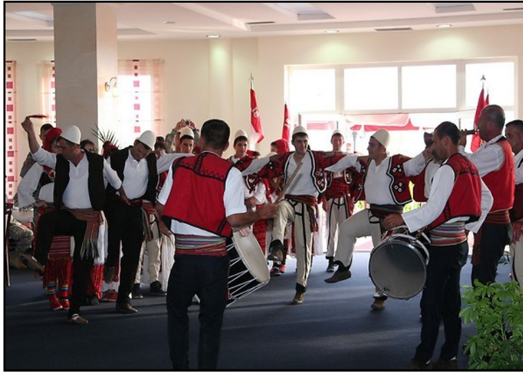
Some ethnic entertainment