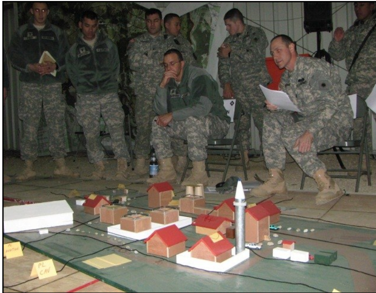
Sand box rehearsal

The MRX rehearsal took place in a sophisticated “Map Room” at the Command Post, with a large scale map of the operating area laid out on the floor. Accurate models of the various buildings and landmarks in the area were set up and labeled so that commanders could walk around the area like some kind of “Gulliver” and visualize it in “3-D” from all angles, while making plans for his part of the operation, or rehearsing it over and over again to get the details correct—a tried and true military technique called “sand box rehearsal.” At Camp Roberts, the models were made of Popsicle sticks and milk cartons. Here, they were nice, wooden scale models, reminding one of the wooden coo-coo clocks, nutcrackers, and pull toys German craftsmen are famous for the world over.