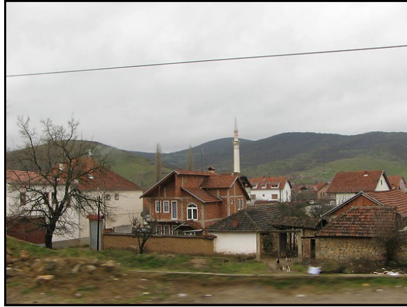
Typical Kosovo village

The scenic countryside ranged from cultivated fields, vineyards, and pastures, to alpine meadows, hardwood and pinewood forests, and rugged, snow-capped peaks. There is an abundance of wild game in the outlying areas, including stag, boar, rabbit, etc. and a few predators, including foxes, wolves and bears. There are several lakes, natural and man-made, and a number of mountain streams, teeming with trout.