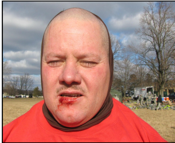
CSM Claude gets a “taste” of very realistic training!

One of the more memorable courses involved the use of pepper spray. As the name implies, pepper spray is a commercial distillation of hot chili pepper essences in a small spray can. Not only did each trooper have to be trained on how and when to use this liquid fire, but then they had to experience it themselves by having their eyes sprayed and then being forced to use a baton to blindly “fight” their way through a couple of “aggressors.” Only then were they allowed to wash their stinging eyes with cold water and recuperate. The cold water felt good on their faces despite the freezing weather, but it was still several minutes before the stinging went away and they could see clearly again.