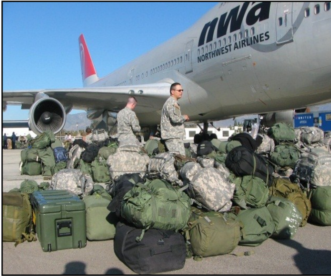
Loading up for Camp Atterbury

tional Guard. In the fall of 2008, it was an important facility for thousands of regular and reserve forces who trained there for the unique circumstances they would encounter when they would be deployed to Kosovo, Afghanistan, or Iraq.