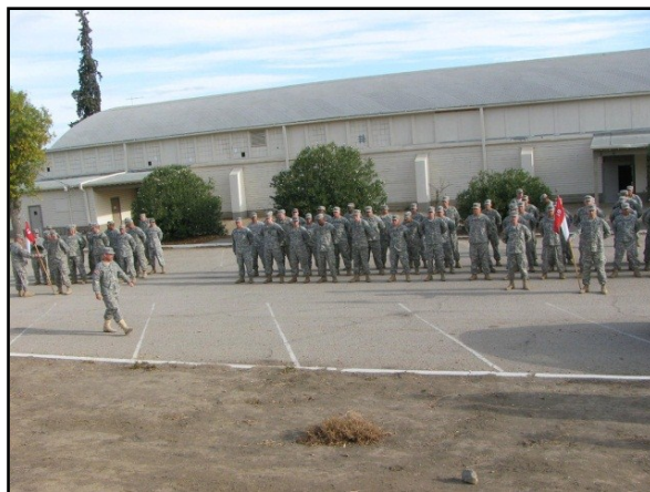
Trooping the line