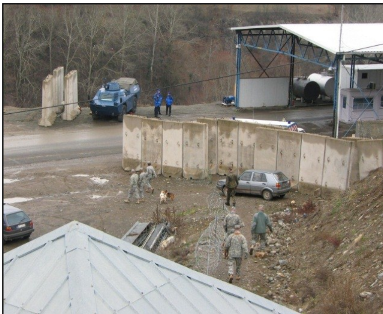
Gate 1 on the Serbian border

However, 2008 had just ended with unrest in Mitrovica, where Serbs were protesting the upcoming first anniversary of the creation of Kosovo, portending events that might come to test that cooperation. This was a peacekeeping assignment to be sure, but it could become a combat operation at any time.