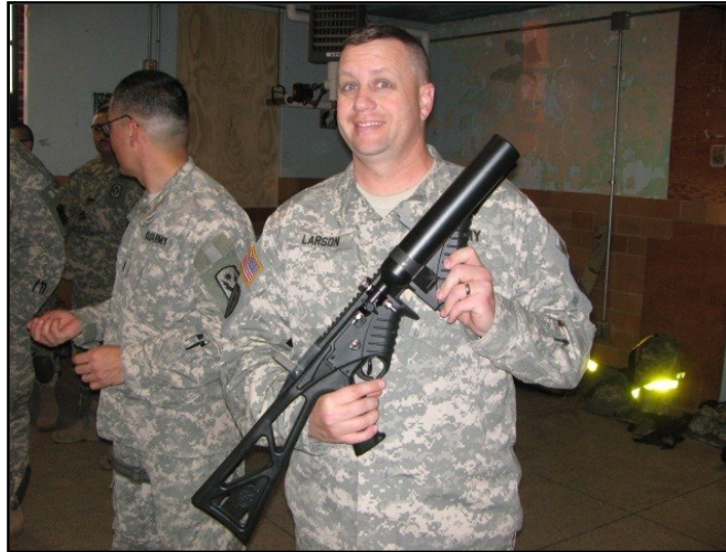
The FN 303 compressed air paint ball gun

This meant being taught how to form up into a human barrier two or three men deep, with large Plexiglas shields to protect them from any projectiles a mob might throw at them, or learning how to use just their hands and a baton to take down an unruly, un-armed civilian for arrest without injuring him. They would learn how to use the FN 303 compressed air gun to fire non-lethal paint balls to mark or deter any trouble-makers that might get out of control in a demonstration or mob action, and how to use the M203 grenade launcher to fire rubber projectiles or tear gas to dissuade any malicious advances or attempted assaults by the crowd.