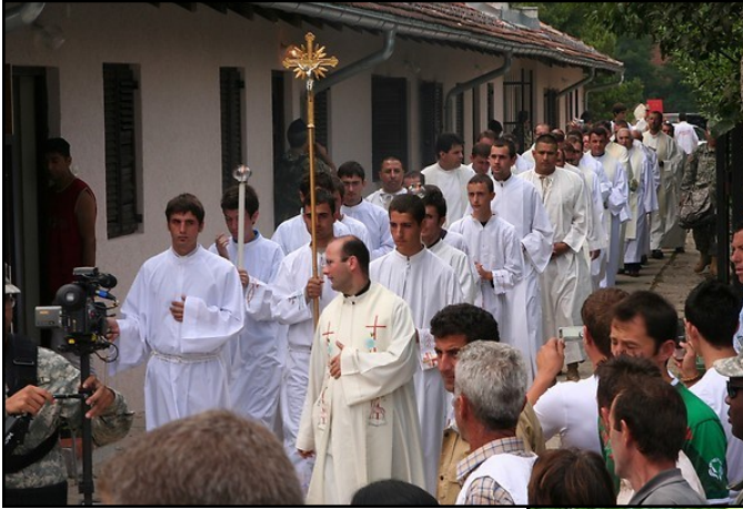
The Black Madonna procession

Pilgrims to the festival followed white-robed priests and altar boys, bearing a Bible, crosses, candles, and censors ahead of the white-robed statue through the streets. Eventually, they arrived at a temporary pavilion by a hillside which provided a pastoral natural amphitheater. There, under a banner that read “The Virgin Mary, pray for us.” in three languages, the masses and vigils were held, with the crowd seated on the grass.