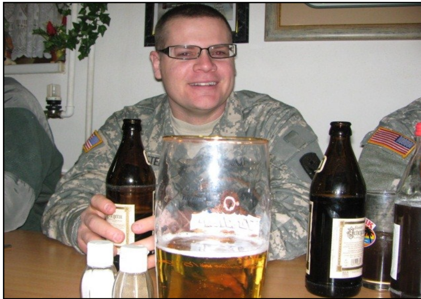
Two for the road

Within a couple of days, they would be in Kosovo. They were as ready as they could be; they had graduated with honors. Now came the real test: enforcing the peace in Kosovo!