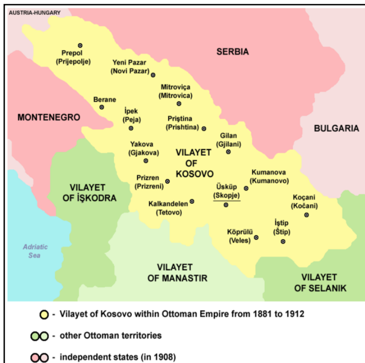
Map of Kosovo in 1912

The next few centuries saw increasing migrations of Albanians into Kosovo and native Serbs fleeing to Bosnia until the Albanians became an overwhelming majority in Kosovo. But the Serbs never forgot, and a wave of new Serbian nationalism in the nineteenth century called on patriots to “Avenge Kosovo!” Albanians too, formed the “League of Prizren”