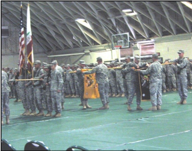
Casing the colors

On Sunday, November 25, the Task Force was assembled in the Camp Roberts field house for a departure ceremony. Family and friends of the Troopers were there to view the traditional military pageantry, accompanied by the 40 th Infantry Division Band.