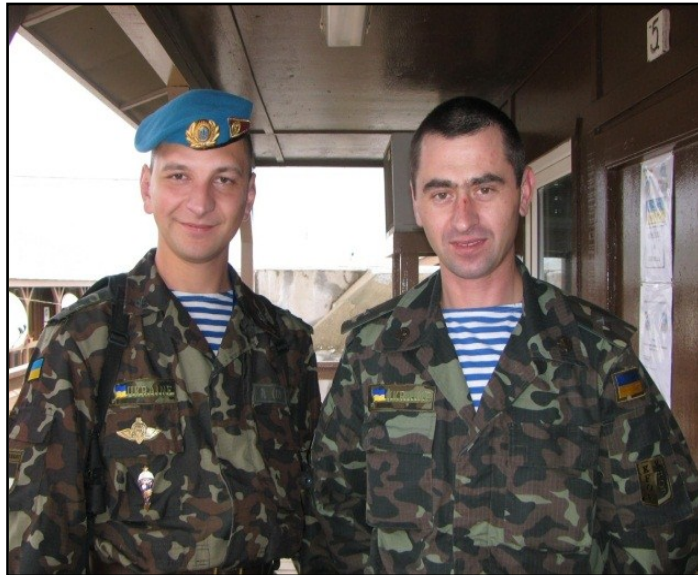
Ukrainian friends at Camp Bondsteel

The international flavors of the occupants made Camp Bondsteel feel rather like an Olympic Village; with young people from all over the world learning how to cooperate and work together. Many friendships were to be made, and many exercises in improving international relations were to be attempted.