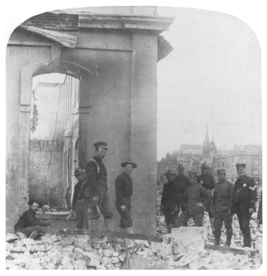
Guardsmen set sticks of dynamite to bring down dangerously tottering walls. Their seemingly random blastings during the fire did little to control the blaze and brought forth public criticism.

of the troops were placed under the supervision of city officials; however, General Funston or his superior, General Greely, who had returned to San Francisco on April 23, always sat in on policy making meetings.