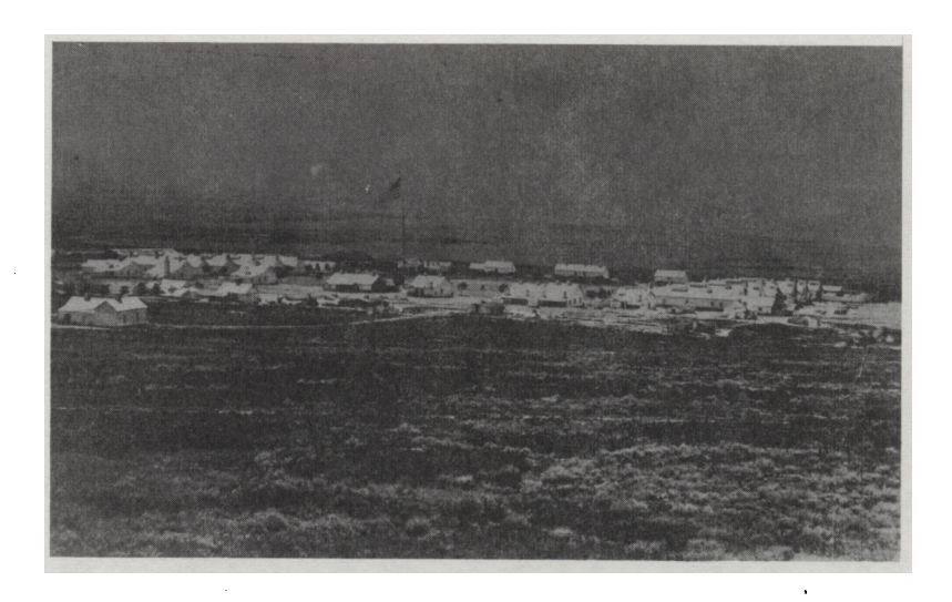
Looking southwest at Old Camp Douglas in 1868.