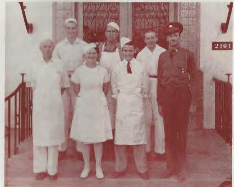
KITCHEN STAFF PERSONNEL

Excellent food is prepared and served by this department not only to patients, but also to the men and women on active duty.