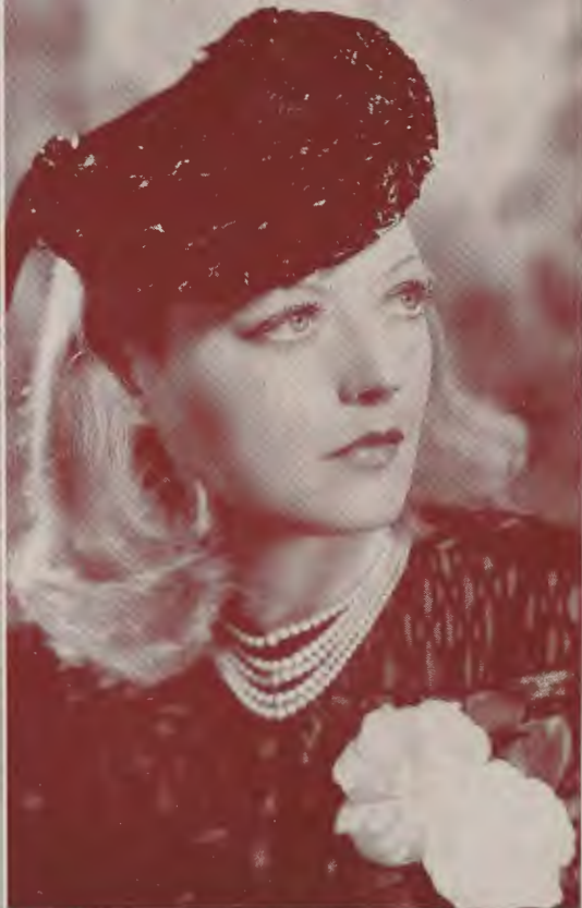
CAPTAIN MARION DAVIES

When the curtain of war lifted over a Nation, a star, an actress known and loved by every American, once more picked up her cue, and stepped forth upon the stage, not as an actress, but as a humble American ready to play her part in the Nation's grimmest drama.