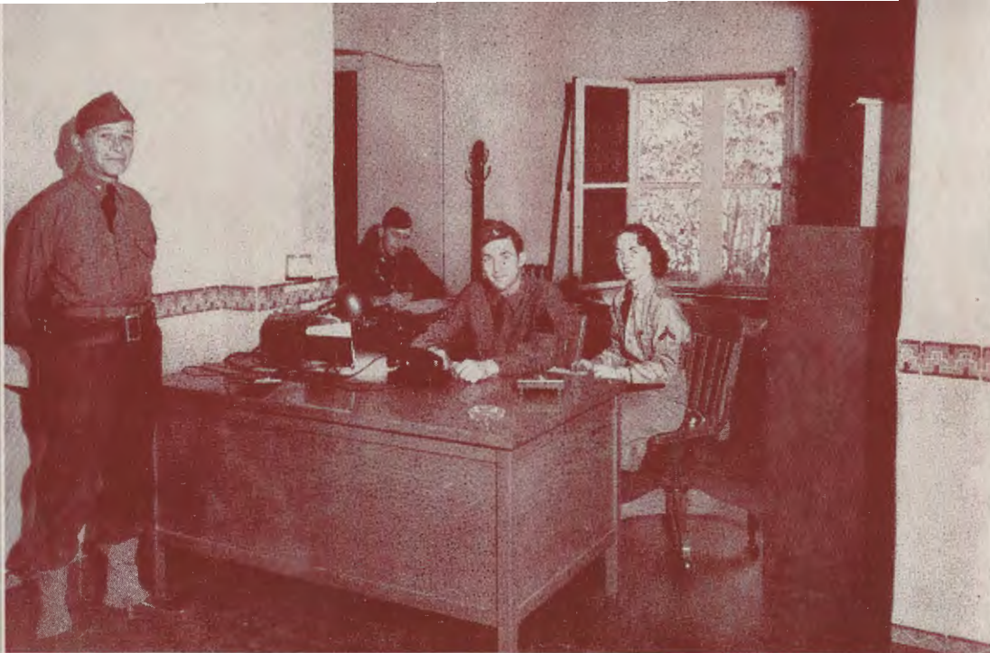
ADMINISTRATION HEADQUARTERS BASE HOSPITAL NO. 1