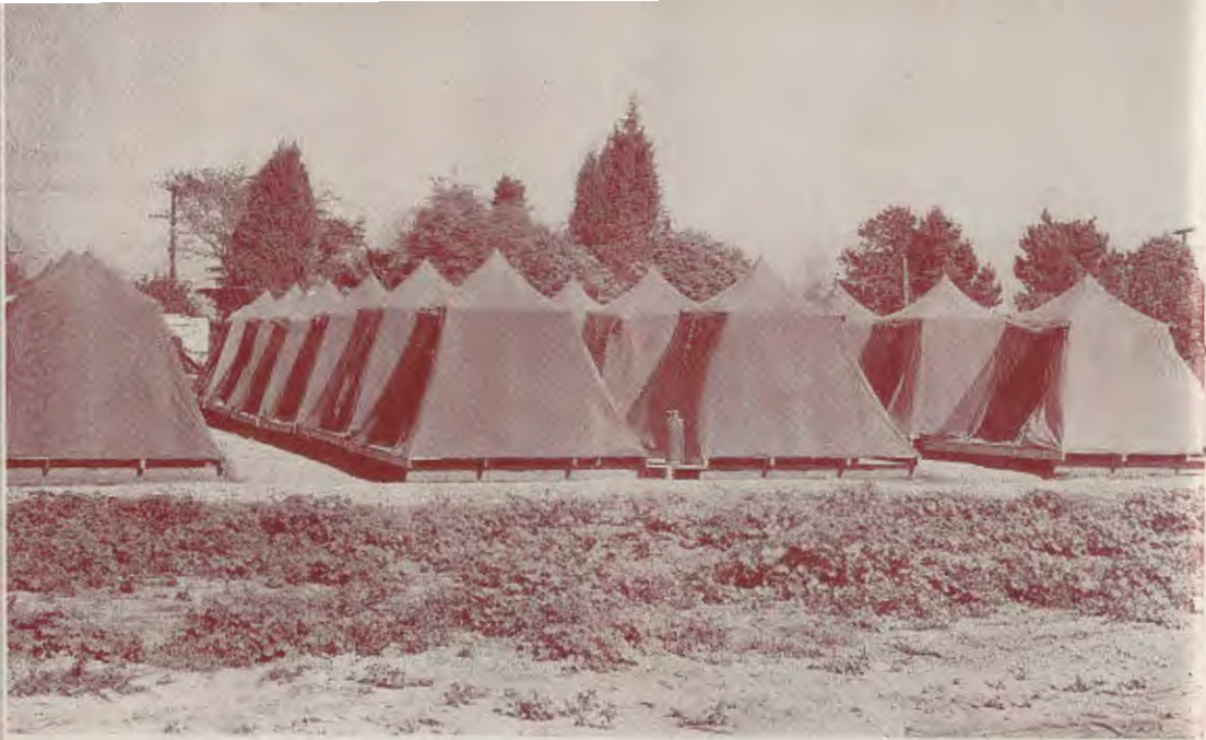
QUARTERS OF ENLISTED PERSONNEL ON DUTY AT BASE HOSPITAL NO. 1