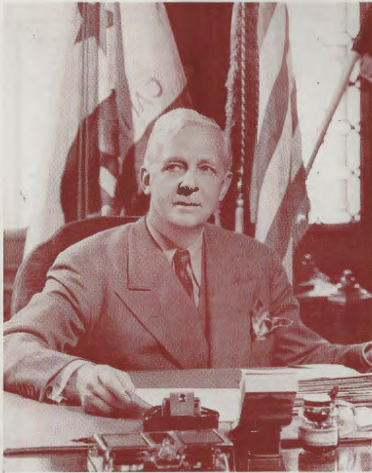
CULBERT L. OLSON Governor of California