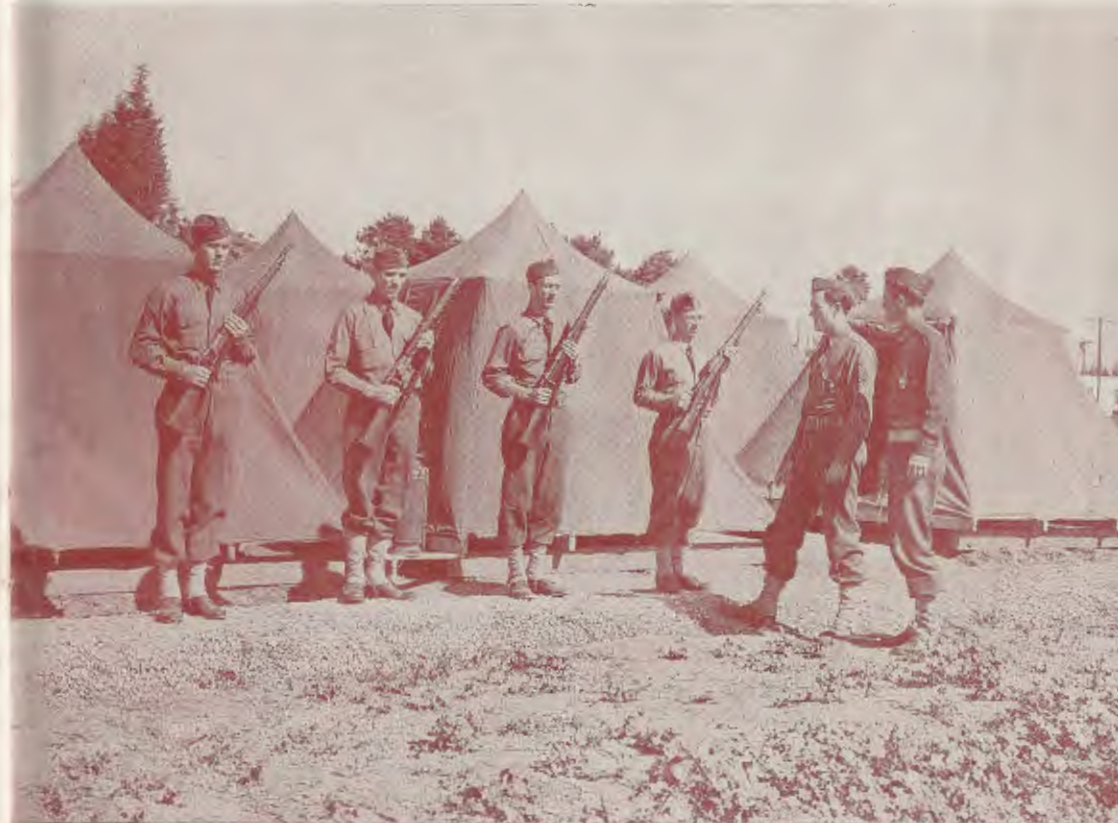
INSPECTING THE GUARD