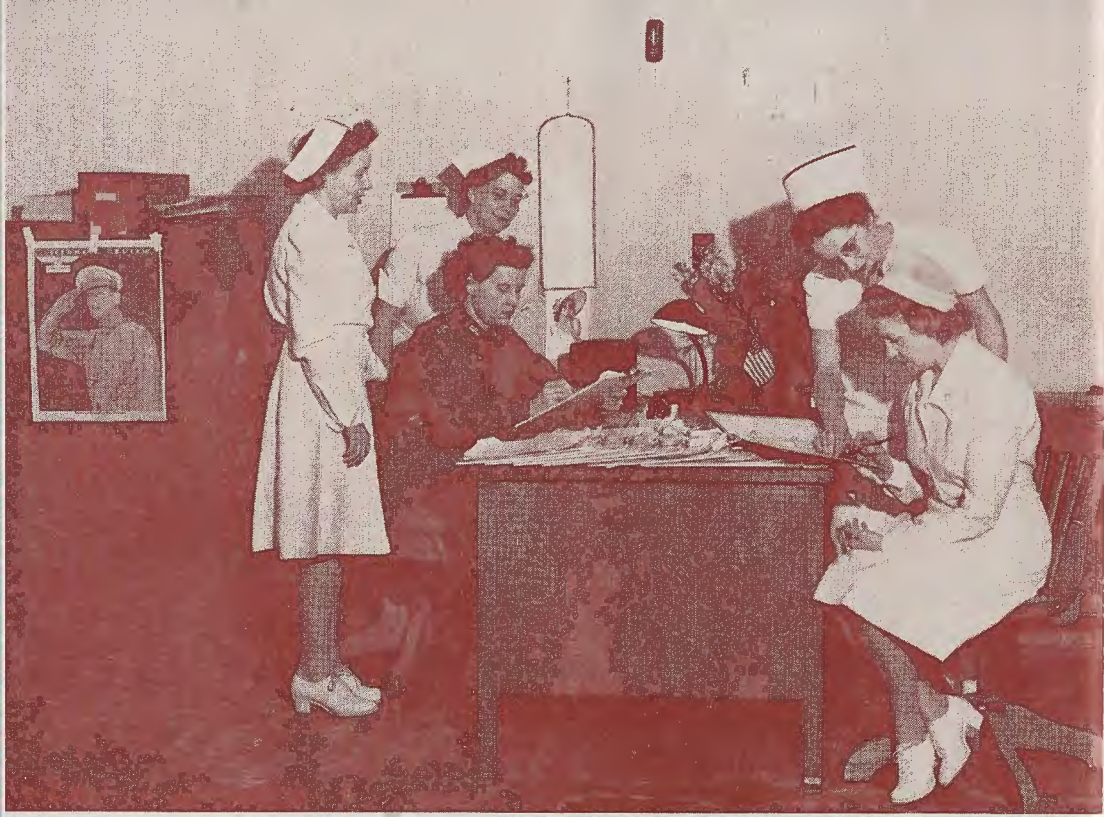
NURSES IN CONSULTATION