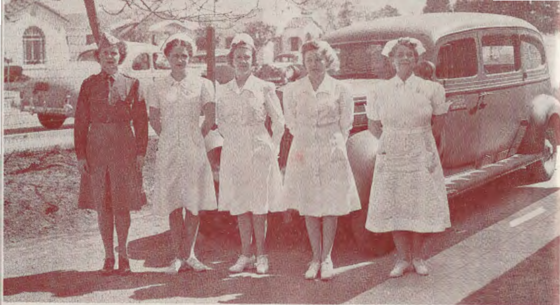
NURSES AND 1939 PACKARD AMBULANCE

This up-to-date Ambulance was presented to the California State Guard, 1st Medical Battalion, by Temple Israel of Hollywood.