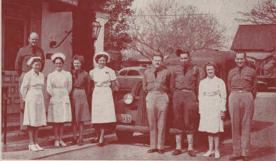
PERSONNEL AT MAIN ENTRANCE, BASE HOSPITAL NO. 1