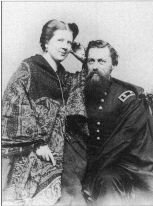
General and Mrs. George Stoneman during the Civil War shortly after their marriage.

toughness, and a strong sense of duty. The hardy settlers of the Chautaugua region did not encourage eloquence or loquaciousness and young George adopted a tight-lipped reticence that characterized him throughout his life.