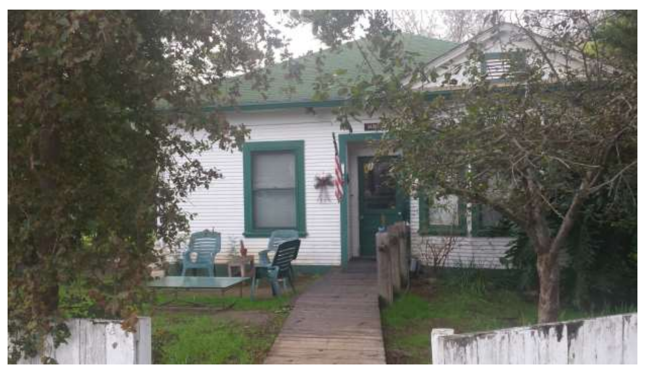
Figure 2. The former Bello Ranch house today.

Soon after acquisition by the state, the neighboring Mainini Family acquired the Chaves' Bello Ranch house from the State of California and moved it across the county road. The ranch house was Moved again in 1941 to make way for the new Gate One off of the new four-lane California Highway 1, this historic house now sits between what remains of the old County Road and today's California Highway 1 at the entrance to the California Men's Colony's East Facility.