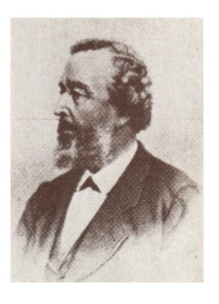
BAYARD TAYLOR Author of "Eldorado" and layman observer of the Constitutional Convention.