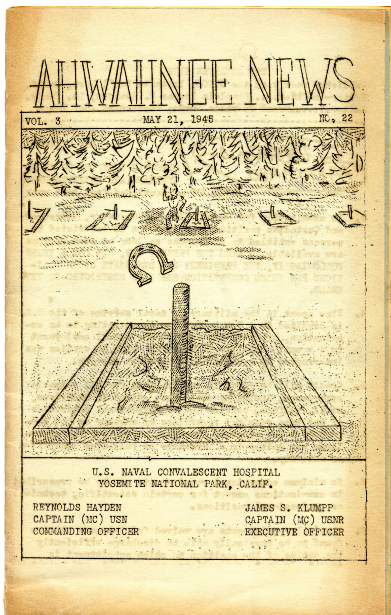
Newsletter from USNCH Yosemite, Calif.

In 1944, the Army's Spadra General Hospital, located 22 miles northwest of Corona was acquired and used as a convalescent annex