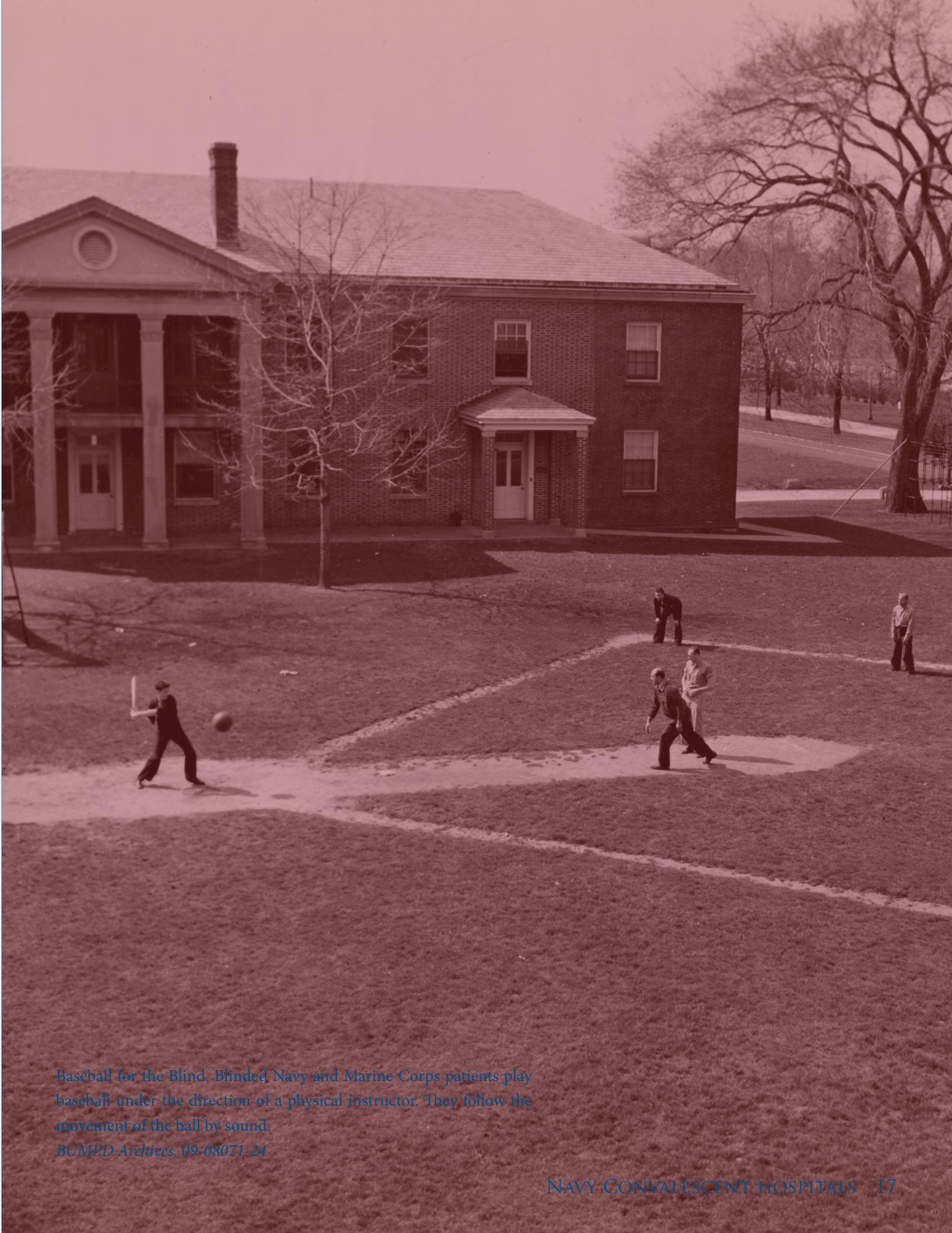
Baseball for the Blind, Blinded Navy and Marine Corps patients play baseball under the direction of a physical instructor. They follow the movement of the ball by sound.