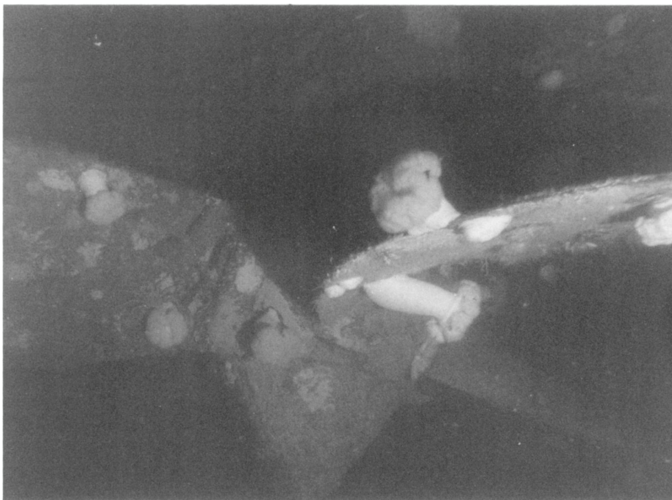
Montebello's single four-blade propeller visible nearly 1,000 feet underwater.