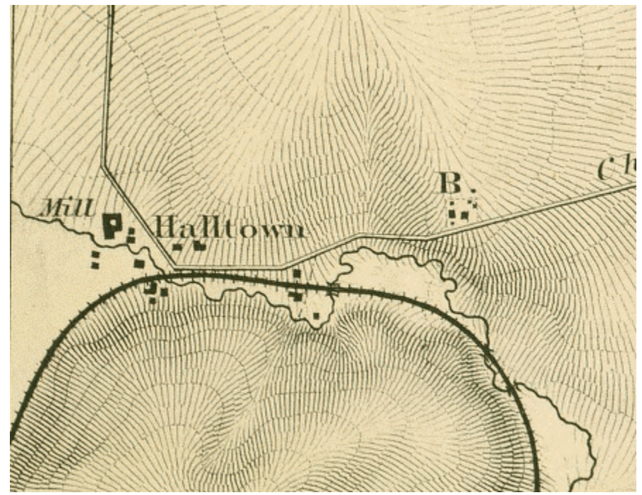
(Later map showing location of Halltown and railroad)